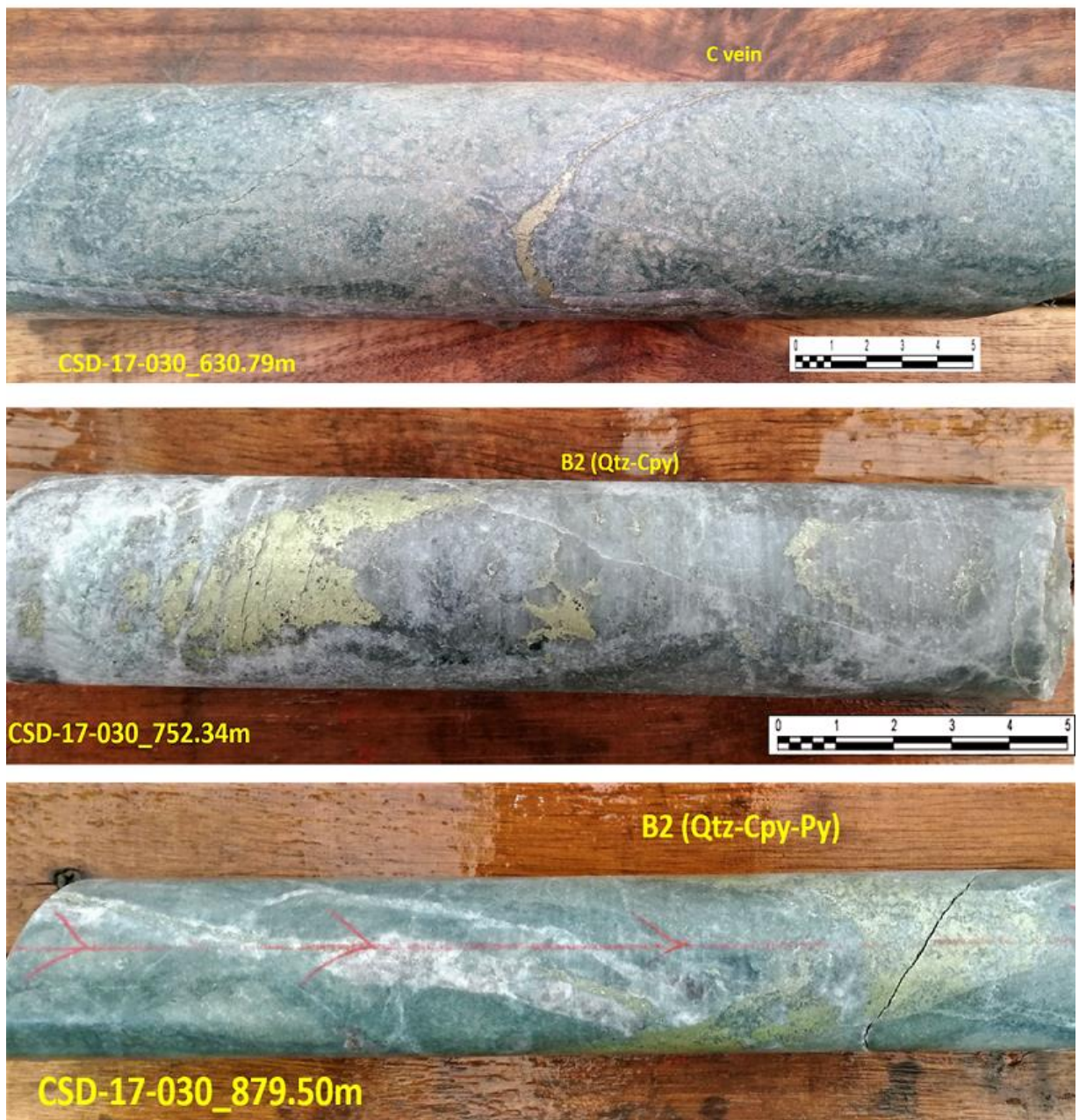
Figure 4: Selected examples of drill core intersected in Holes 30 thus far, at Alpala Central.