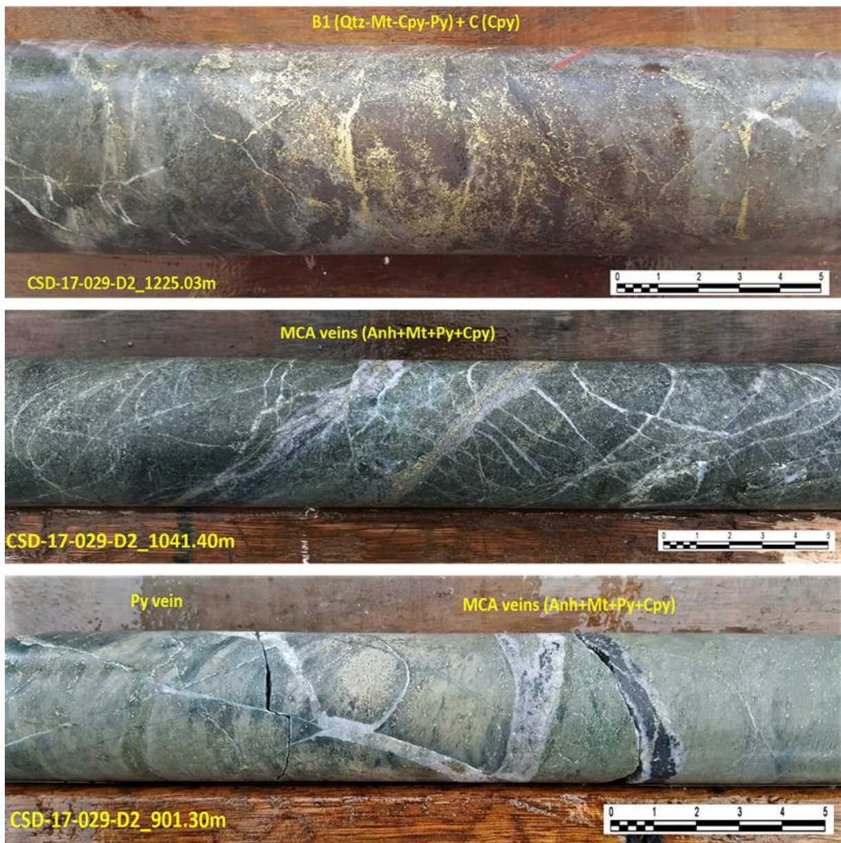
Figure 3: Selected examples of drill core intersected in Hole 29-D2, at Alpala Northwest.