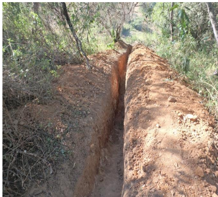
Figure 4: Photograph of completed trench. Samples are collected from basement rock either by continuous rockchips or by diamond saw cuts, and sampled to geological boundaries.